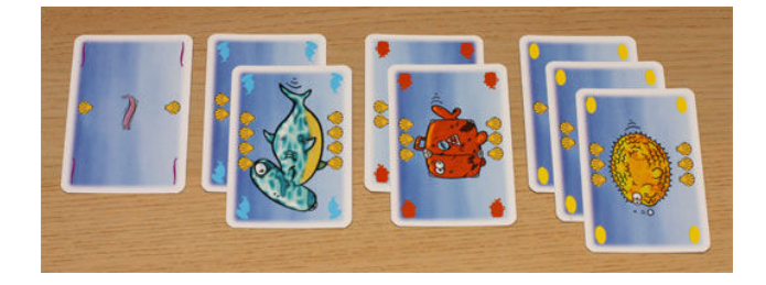
Total points = 1 + 4 + 3 + 3 = 11

When the last card has been drawn, the session ends. Each player adds up the highest value (most number of shells) fish of each kind. The points are recorded on a sheet. Another session begins with the game preparation. Points of the next session are added to the previous session.