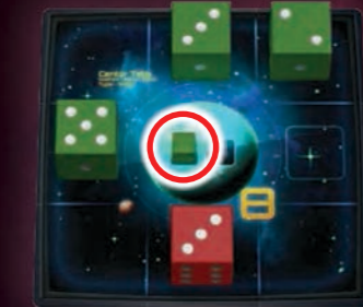
The green player uses two actions and places a quantum cube on the planet. The green player cannot build another quantum cube on the same planet because there is already a green cube there.