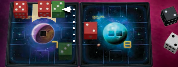
The green 3 attacks the red 4. Both players roll combat dice and get 2s. The attacker has a lower total and wins the combat.

The attacker is NOT destroyed, but simply moves back into the square from which it attacked. No dominance is gained or lost. There is no risk to the attacker should an attack be unsuccessful.