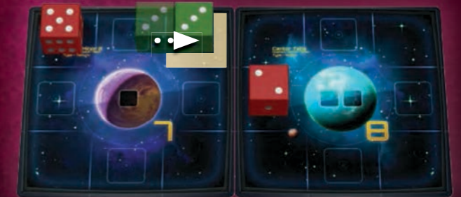
The red 4 is rerolled and placed in the red player's scrapyards. The green player decides to move the 3 back into the square from which it attacked. The attacker gains 1 dominance and the defender loses 1 dominance.