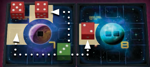
MOVING TO ATTACK POSITION: The green 3 can use its 3 movement to attack the 4 or the 2 but the 5 is out of reach.