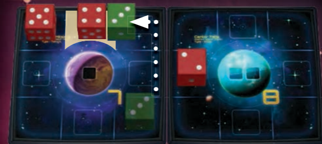
The 3 decides to attack the 4 and is placed halfway into the 4's square.